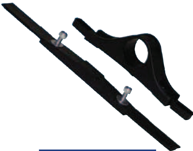
IT - ADJ